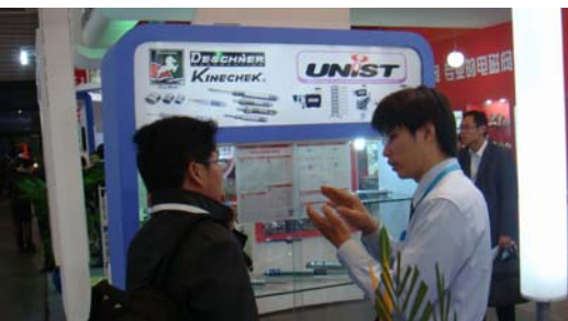
Danyao staff engineer discussing Deschner products at PTC

Singapore Republic of Korea Thailand Vietnam