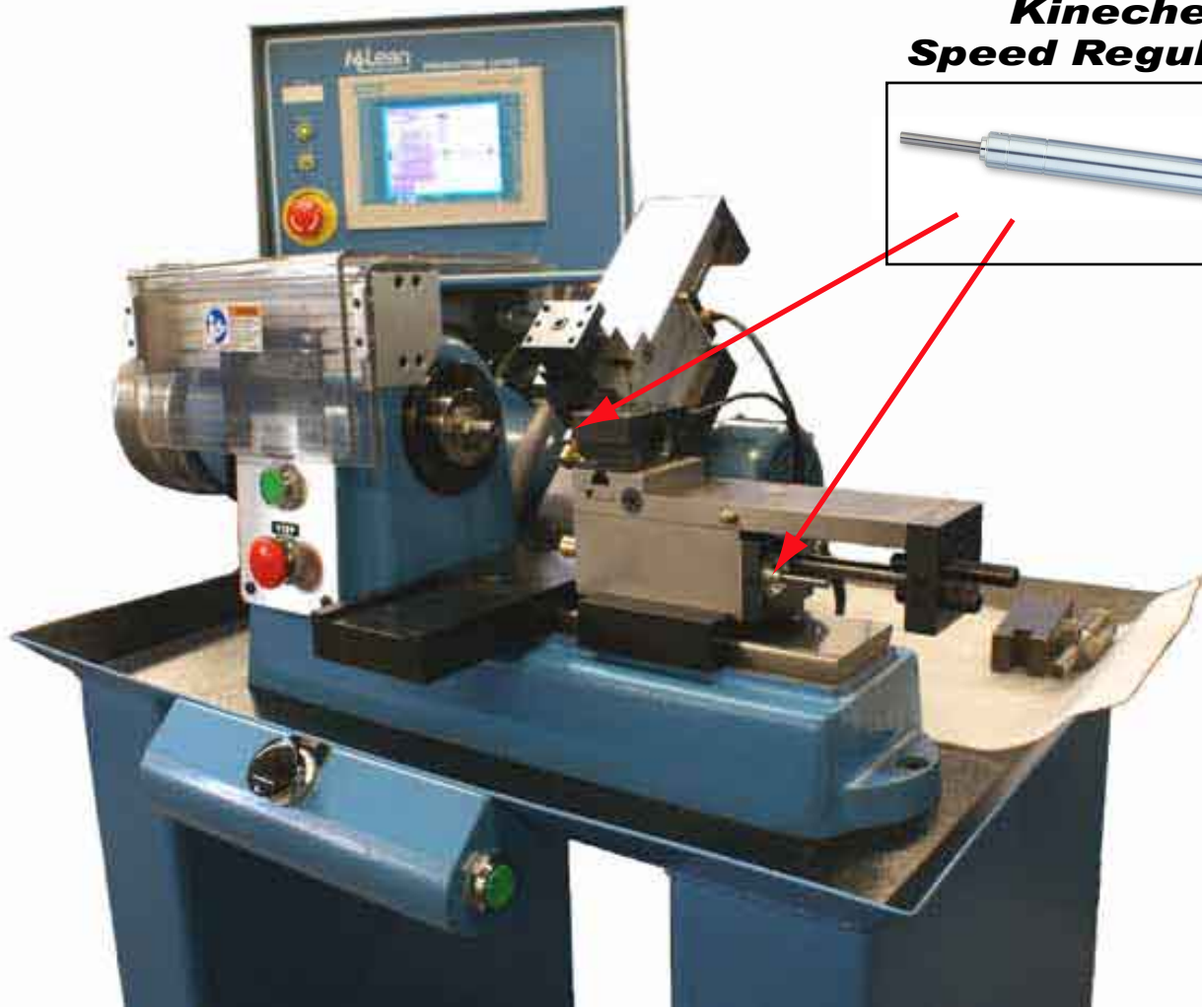
McLean Production Lathe using Deschner Kinecheks